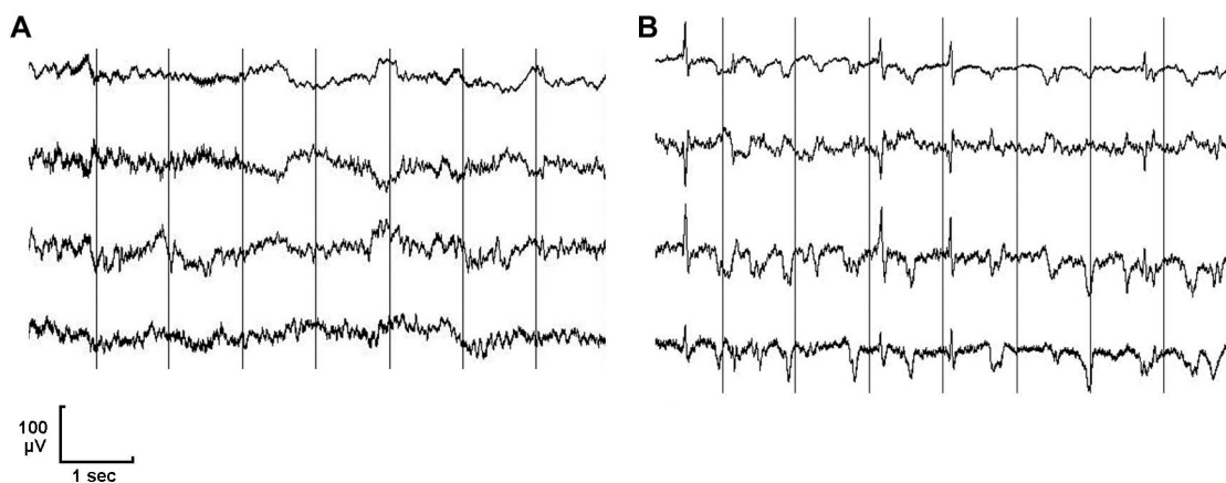
Figure 6.3: Filtered EEG traces acquired during fMRI acquisition of the curarized (a) and the alpha-chloralose anaesthetized (b) state. The EEG signals resort from 4 non-invasive carbon electrodes positioned on the head of the rat.

Two EEG traces of the same rat obtained during the fMRI experiment are shown in the curarized (figure 6.3a) and the anaesthetized state (figure 6.3b). The spontaneous EEG of the curarized animal (figure 6.3a) is comparable to the normal EEG of an awake rat, i.e. having characteristics of both an active and a resting animal. When a rat is exploring, the EEG shows desynchronization consisting of small amplitude and theta activity. In the wakeful resting state the theta activity is not present. The EEG trace of alpha-chloralose anaesthetized animals contains high-amplitude transients superimposed on apparently normal background activity and possibly indicative of alpha-chloralose evoked irritation. These traces with the high amplitude transients shown in figure 6.3b are specific for alpha-chloralose anaesthetized animals and reported in other studies 20 . Except for these alfa chloralose specific differences the overall EEG signal displays the same normal background activity of a rat being asleep, which EEG pattern is characterised by the signal changing from small amplitude fast activity into large amplitude slow activity. No difference is observed in the EEG traces between the activated and the resting state in both states of consciousness.